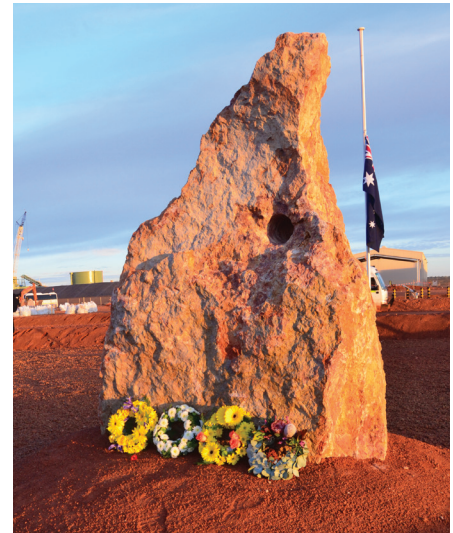
Wreaths were flown from Perth for the ceremony while mining contractor Macmahon Holdings fabricated silhouettes to reflect the symbols of Anzac Day.

Wreaths were flown from Perth and ex-servicemen fell in at the front of the gathering. Extra meaning was given to the NZ National Anthem with a stirring Haka performance to close the ceremony.